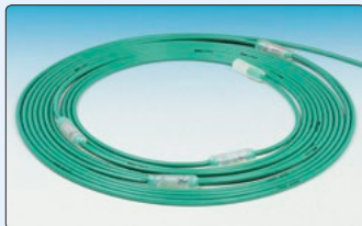
• Model 3810A (Addressable) Thermistor String, shown with 5 sensors.