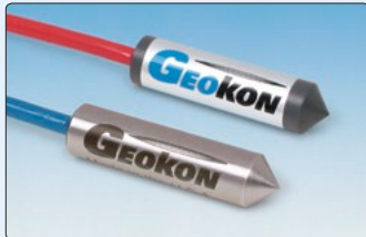
• Model 3800-1-1 (top) and Model 3800-2-1 (bottom) Thermistor Probes.