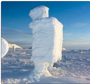
• Winter view of the above installation.*