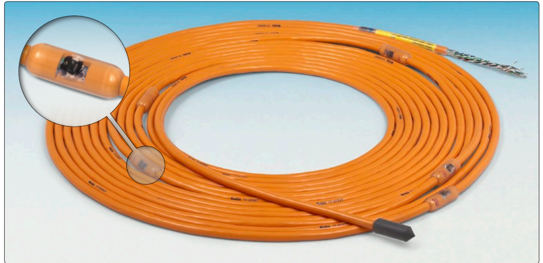
• Model 3810 Thermistor String (inset shows a close-up of an encapsulated sensor).