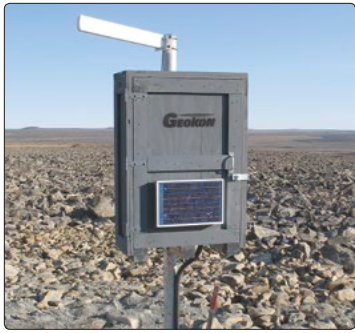
• Summer view of the Geokon Model 8025 Data Acquisition Station measuring a 70 m deep Thermistor String in mine tailings, located in northern Canada.*