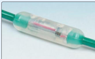
• Close-up of an encapsulated sensor from the Model 3810A (Addressable) Thermistor String.